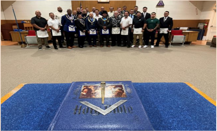
May 2024 Stated Meeting Picture

Our lodge clean-up was a success! Special thanks to those who volunteered their time and effort to help clean our Lodge Office.